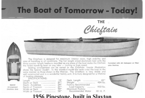
1956 Pipestone, built in Slayton

Minnesota Governor Orville Freeman came to Slayton on July 23, 1957. One of his stops was to view products of the boat works. The governor sat in one of the runabouts and commented "nice boat."